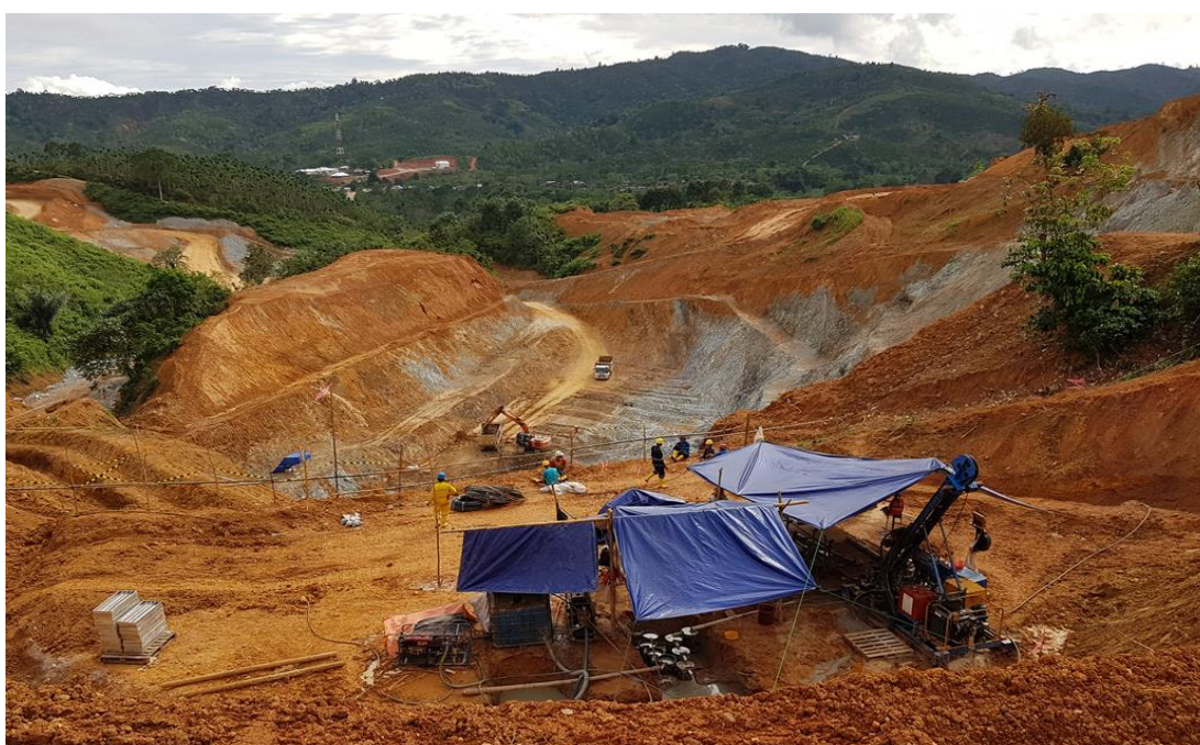
FIGURE 1: Diamond Drilling at Talang Santo