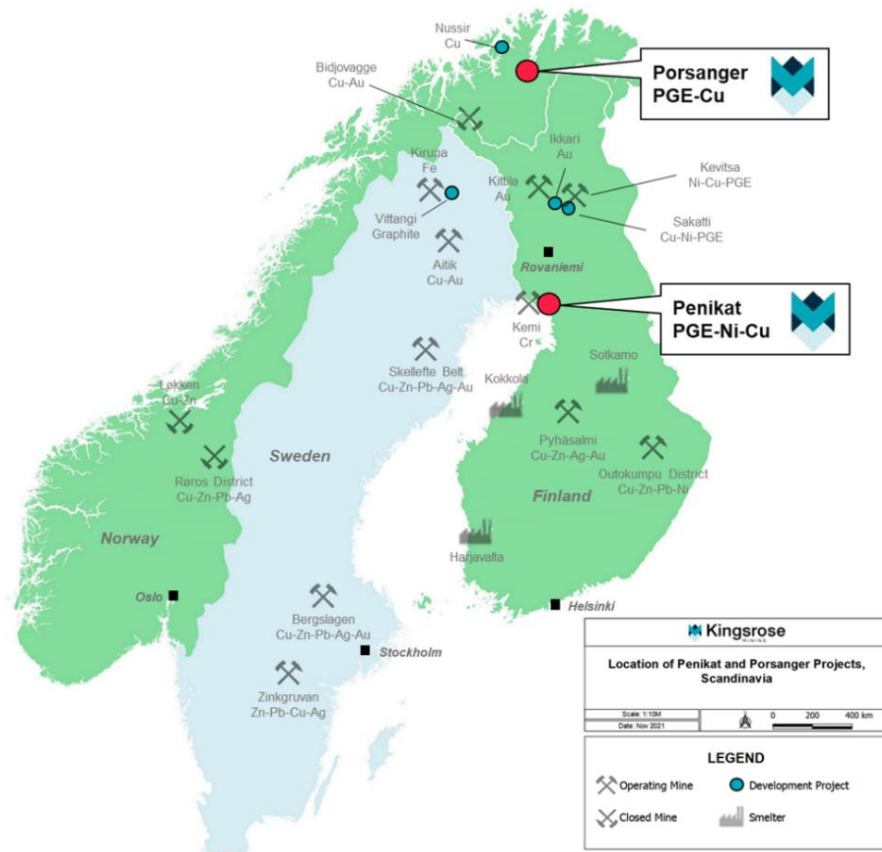
Figure 1: Location of the Penikat Project and Porsanger Project within Scandinavia